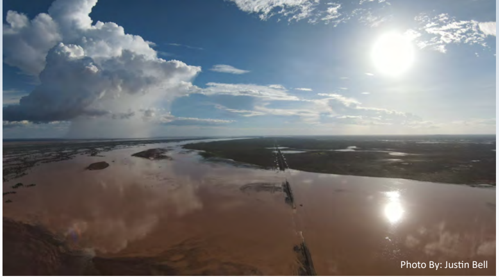
The gates at Diamantina Lakes 3/2/24