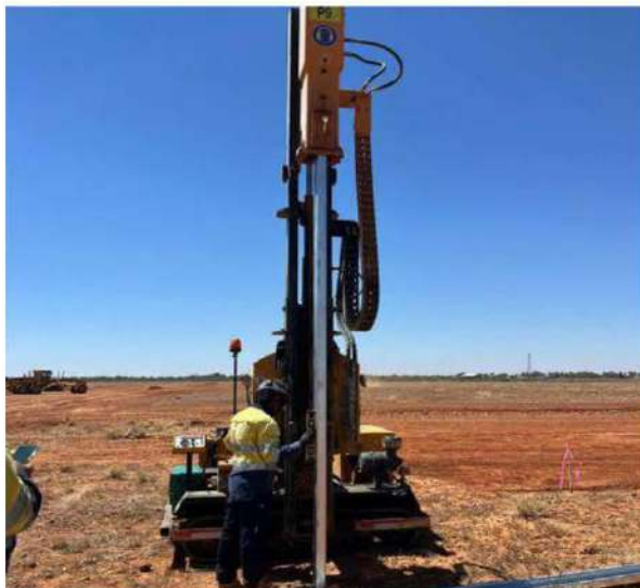
Fig 1 – Pile driver installing the first of the solar array posts.

Our contractors, Yurika, have started civil works to prepare the site. They have cleared rock and have started excavation for trenches that will house the conduits for the facilities underground electrical cables. Work to drive the posts for the solar array frames is also well progressed – see figures 1 to 3.