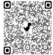
Project website QR code.

To keep up to date on the project, visit our project website Boulia solar farm & battery project | Ergon Energy or scan the QR code.