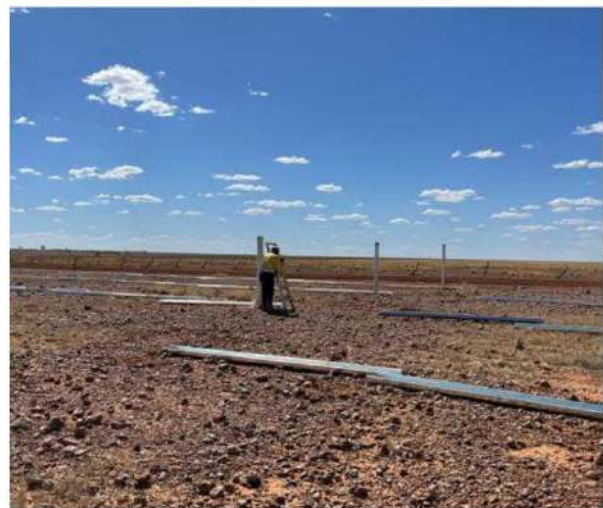
Fig 2 – Delivering a quality job - the team ensures the posts are straight and aligned before starting the framing work.