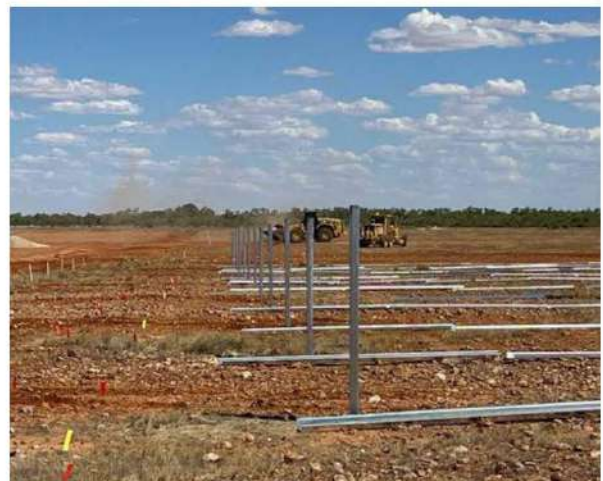
Fig 3 – Civil work and construction of the solar array is happening concurrently on site, with good progress is being made.